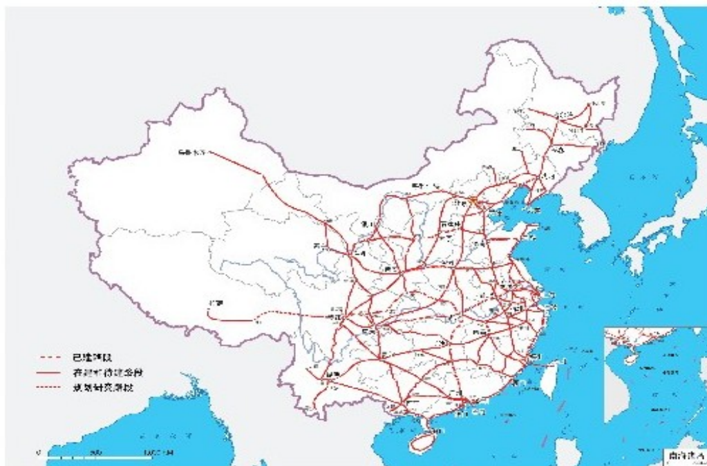
Figure 2 National express railway network

Column 7 Priorities of traffic construction, Xinhua News Agency