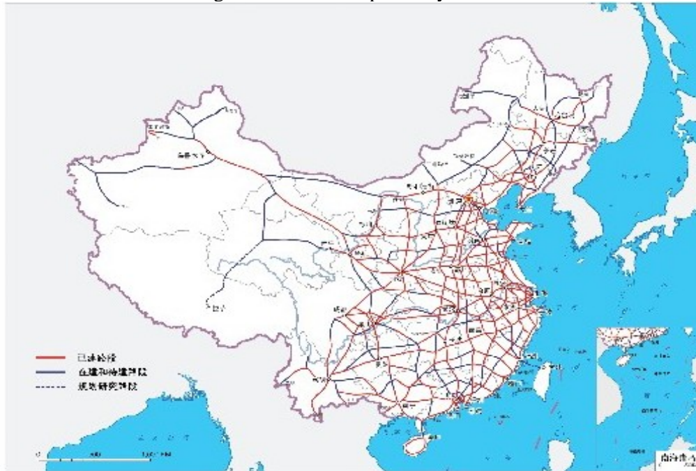
Figure 3 National expressway network